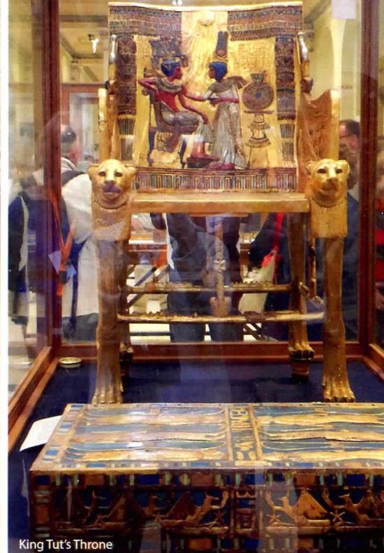
King Tut's Throne