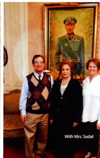
With Mrs. Sadat