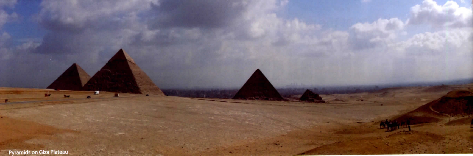
Pyramids on Giza Plateau