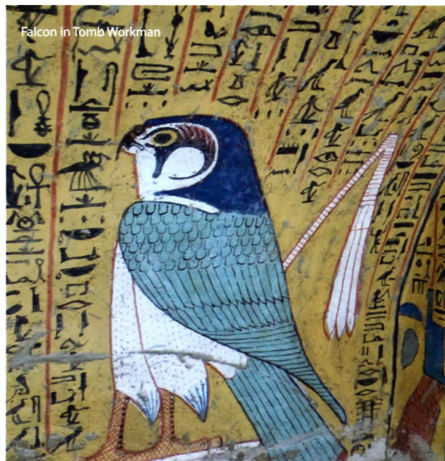
Falcon in Tomb Workman